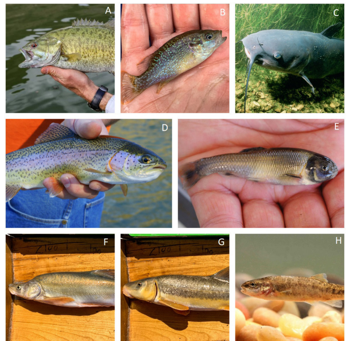
Figure 3: Example species in the community of fish in Lake Mead and the Grand Canyon. Warmwater invasive species include smallmouth bass (A), green sunfish (B), and channel catfish (C). Coldwater invasive species include rainbow trout (D) and fathead minnow (E). Native fish include humpback chub (F), flannelmouth sucker (G) and speckled dace (H).

native freshwater fish survival are habitat alteration and nonnative fish takeover (19). In the southwestern United States, the negative impact nonnative fish have on native fish eclipses the impact of habitat alteration; restoring habitat in this region does not lead to biological recovery unless native fish are removed (20).