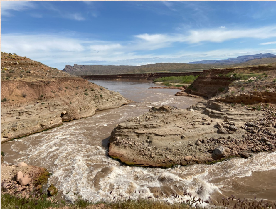
Figure 1: Pearce Ferry Rapid in 2020.

The water elevation of Lake Mead, Arizona, has been continually dropping over the past two decades due to drought (1). When lake waters were at their maximum, a large amount of sediment that was picked up by the Colorado River in the Grand Canyon was deposited in the lake, where the water slowed. Since the water has receded, those sediments that were once submerged under Lake Mead are once again in the river's path. The Colorado River has been carving through these sediments, finding a new path compared to the route it took before the Lake was initially filled. As a result of this new path, the river now cascades over a section of boulders known as Pearce Ferry Rapid. This class VI rapid, considered 'un-runnable' by rafters and boatmen due to its steep and tumultuous flow pattern, may be impassable to fish trying to move upstream. In fish biology, a barrier is any structure that restricts the physical movement or genetic flow of fish (2). Waterfalls and rapids within river systems, when high and steep enough, are one of these barriers to fish passage (3). Although large rapids may isolate fish communities, in the context of the Grand Canyon the beneficial outcomes from the creation the Pearce Ferry rapid (figure 1) as an invasive fish barrier may outweigh the disadvantage of blocked migration routes for native fish.